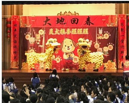
Adorable Lions heralding Joy and Good Tidings during the concert