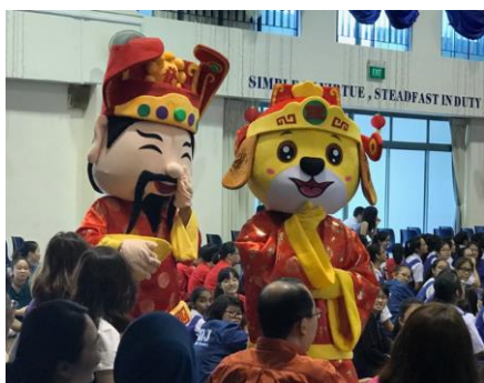
Playful, much-loved CNY mascots

As a traditional festive custom, a lion dance troupe was invited to the school to put up a lion dance performance to ward off any bad luck and to bring in good health and prosperity for all in the school. While the lions were parading in the school hall, some of our SJCians playfully tapped on the backside of the lions! Not far away on the stage, the mascot of "the boy with the big head" was also mischievously pulling pranks on our school leaders when they were trying to give ang pows to the boy and this scene greatly tickled the crowd.