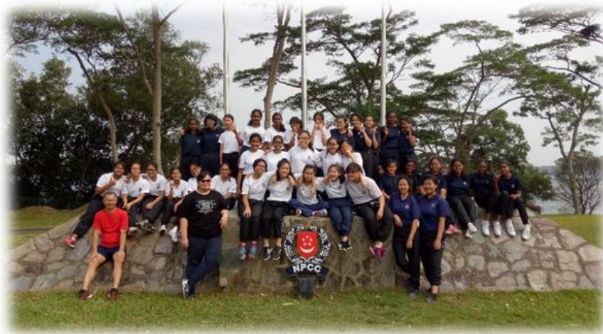
Tired but happy and satisfied cadets and their teacher-leaders at the end of an exciting camp.