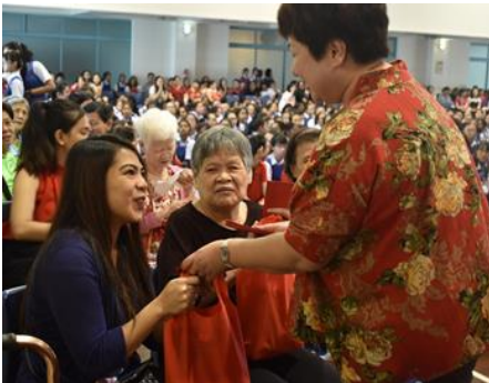
Celebrating with community partners

Chinese New Year is not simply a time of renewal and fresh beginnings for the year ahead, it is more importantly, a renewal of ties within school and to the wider community that we are a part of. Preparations for the Chinese New Year started weeks before with students and their form teachers coming together during a Character and Citizenship lesson to prepare gift hampers of food and snacks for the elderly from the IJ Home and Lions' Befrienders who accepted our yearly invitations to celebrate the occasion together with a luncheon and to be our guests at the CNY celebratory morning concert by students and staff.