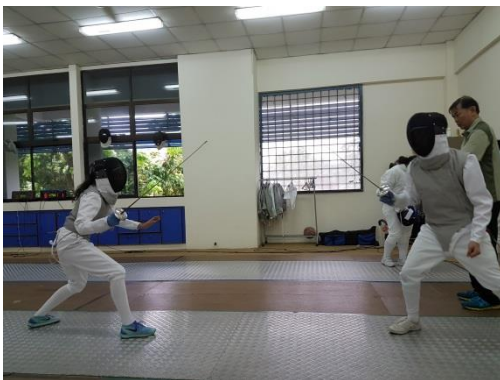
Competing at CJC

As part of the Fencing CCA's milestone checks, SJC Fencing has been engaging in competitive friendlies.