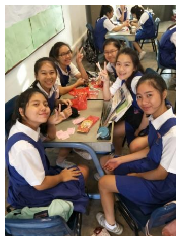
Fun folding origami dogs using recycled red packets