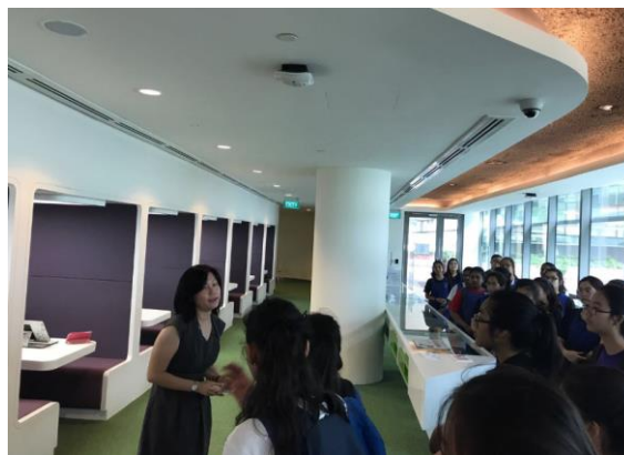
A glimpse of the cosy study booths on campus

This afternoon spent at SUTD has given us an insight to university education, especially one geared towards the STEM (Science, Technology, Engineering and Mathematics) industry. With many students being unaware of STEM and its related jobs, this university has opened our eyes to many new job prospects that we could explore. We were first given an admission talk about the different pillars and multidisciplinary aspects that the school focuses on and then a mini tour around the school. During the talk, the lecturer emphasised a lot the development of products that may potentially help improve people's lives. This is a key learning point for me as it made me realise the importance of finding a purpose in what I do. The tour around the school was intriguing as we were exposed to the many types and uses of 3D printing machinery and had the opportunity to touch many structures of different textures made by these machines. All in all, this trip inspired me to pursue my interests which will allow me to put my 100 percent in all that I