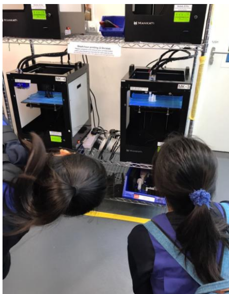
Observing a live demonstration of 3D printing