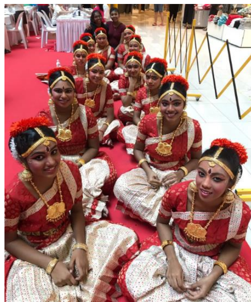
Awaiting their turn to perform

The second and third practice sessions were much better as we had all recalled our steps and were all looking forward to the performance. On the day of the performance, we were all quite relaxed unlike on SYF day. Although we were performing the same dance, it felt different as we were not