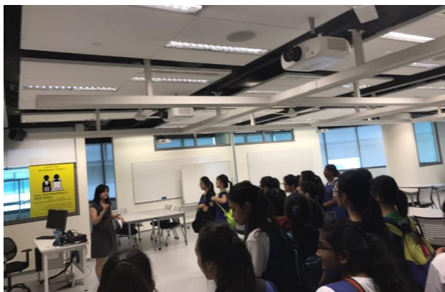
SJCians touring the student-centred classrooms

other universities and corporations. The visit started with an admissions talk by the university staff on the various undergraduate courses available as well as the personal and academic qualifications sought after by the tertiary education institute. Students also had a glimpse of campus life in SUTD through a short tour of the campus facilities. Excerpts from our students' reflections are reflected here.