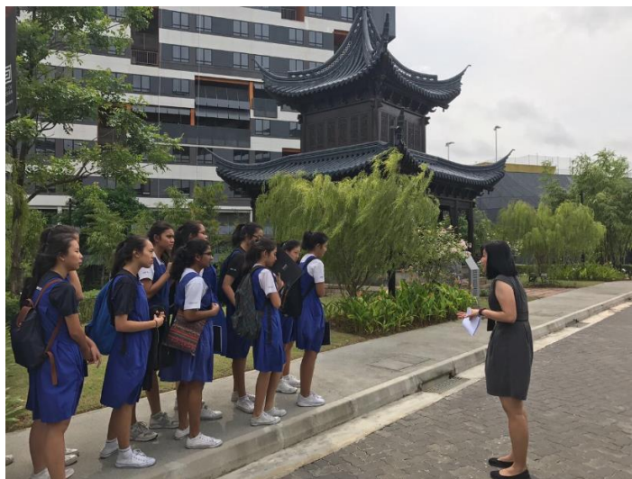
Touring the SUTD Campus

Dear SJC Community, here are highlights from our June and July calendar.