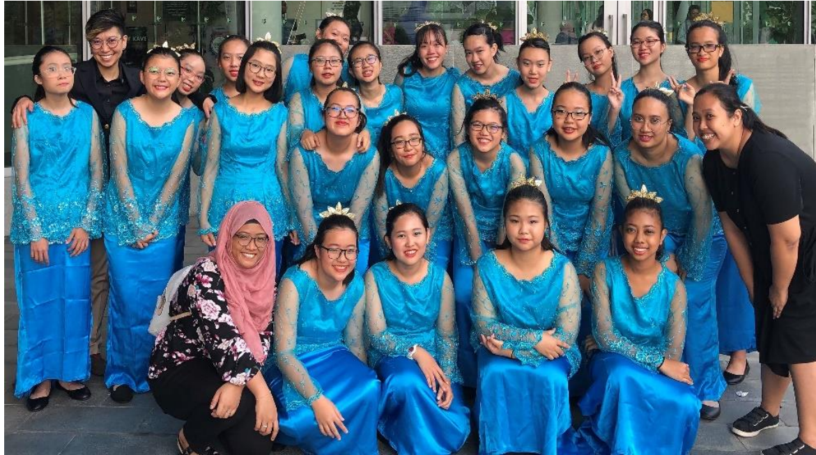
Angklung & Kulintang Ensemble