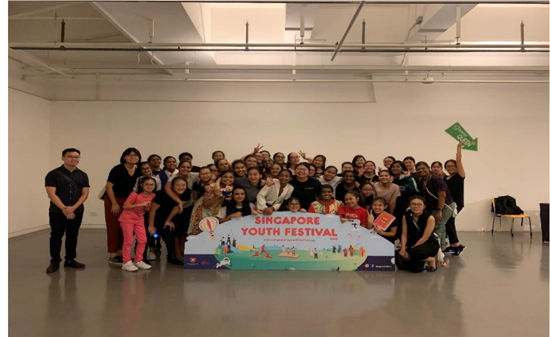
CentreStage - Drama