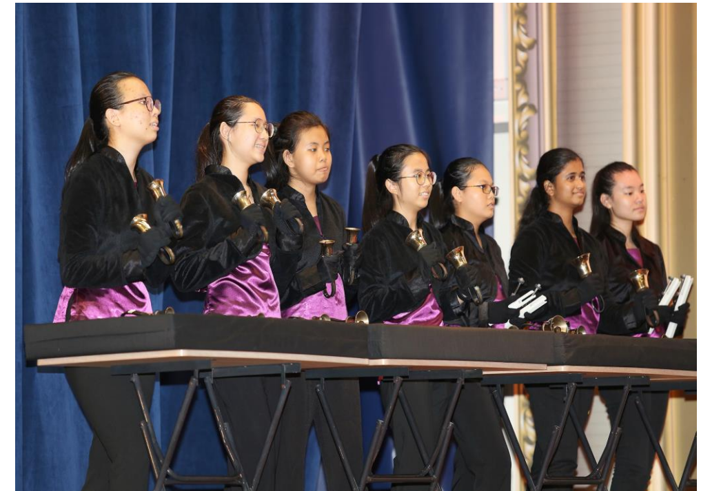
Handbell & Handchime Ensemble