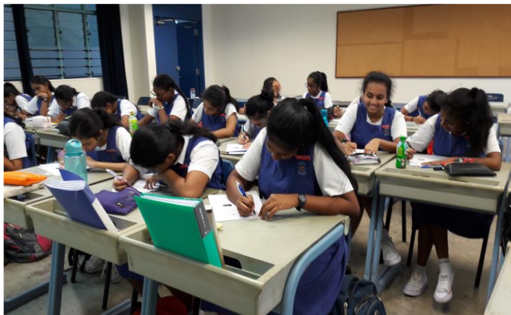
Secondary Threes thoughtfully crafting their creative writing pieces.