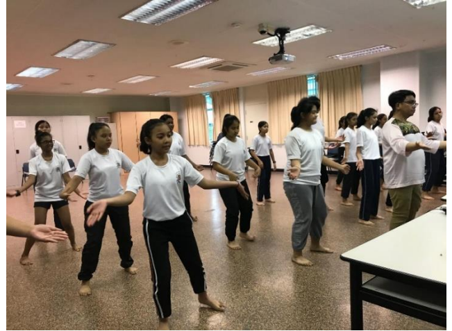
Secondary Ones at their Malay Dance workshop