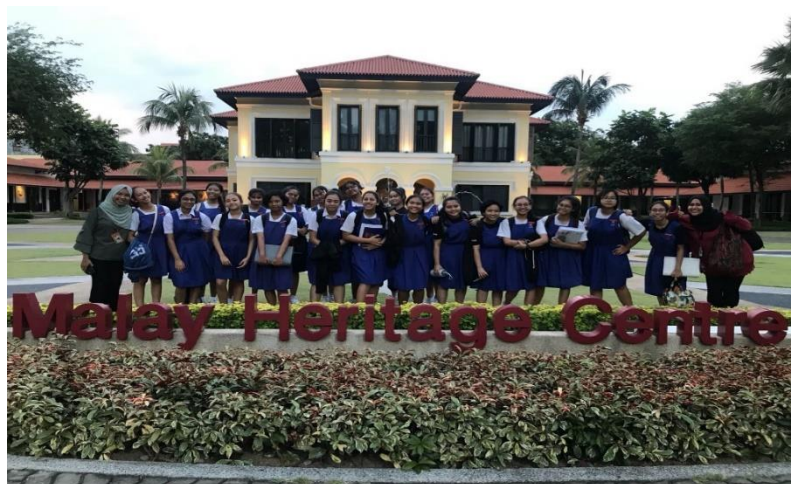
SJCians with their teachers at the historic Malay Heritage Centre, the site of the evening's theatre performance

Situated in the compound of the historic home of Malay royalty, the Malay Heritage Centre was then known as Istana Kampong Glam (Kampong Glam Palace). SJCians had a taste of the bustling area at night. For most, it was their first time stepping foot into the historical palace. It was a meaningful experience as they got the opportunity to see how the Malay palace could have looked in the past.