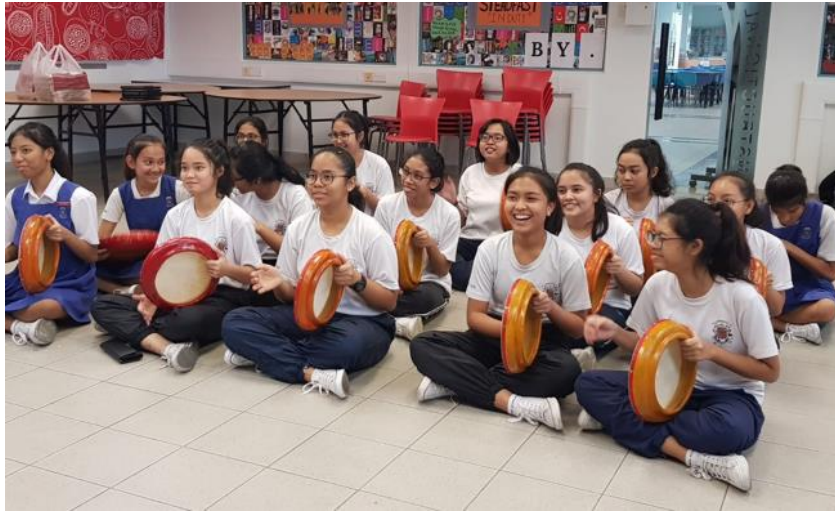
Secondary Threes learning the Kompang in the I&E Room