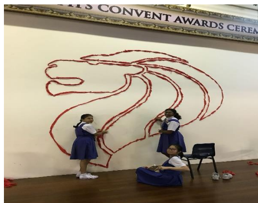
Our student councillor organizers working quietly behind the scenes putting up decorations in the school hall

The ceremonial march-in and flag-raising ceremony have always been a significant feature of the National Day celebrations in SJC. They are an integral part of any official National Day observance ceremony in Singapore schools. Students from uniformed groups are given this special honour to bear and raise the flag for this important occasion.